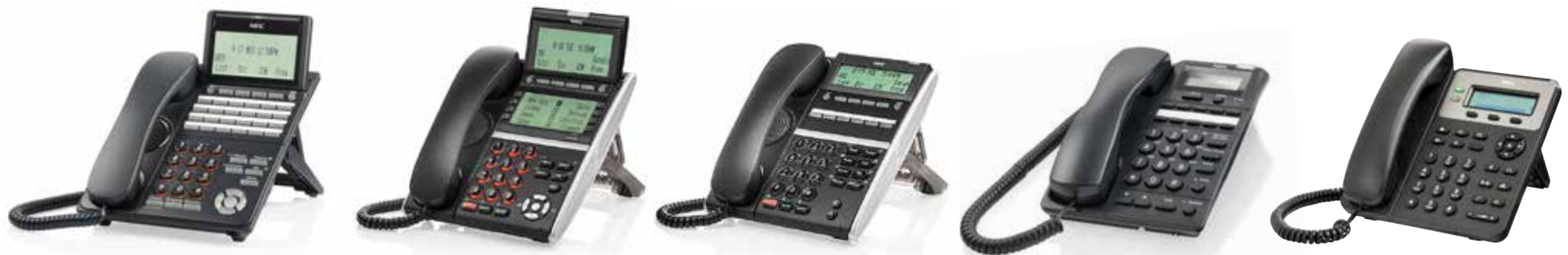
DT530 24 button