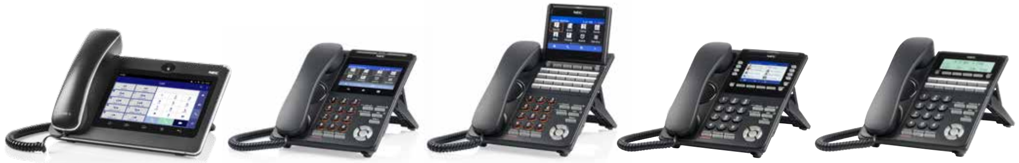
GT890 Video Phone