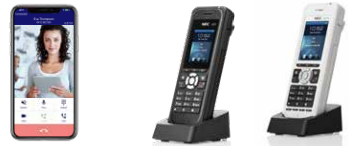
ST500 Mobile Client

*Handsets may have regional availability - check with your NEC reseller for further details