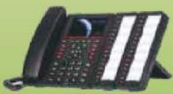
DTSX DIGITAL PHONE ITSX IP PHONE