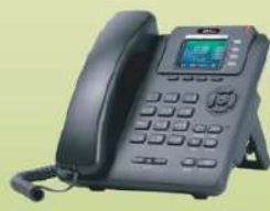
SIP-T800 IP PHONE