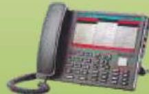
DTS700 DIGITAL PHONE ITS700 IP PHONE