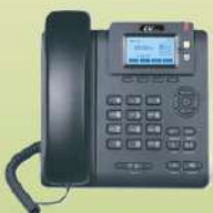
SIP-T790 IP PHONE